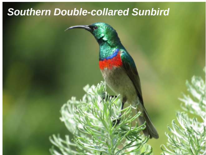
Southern Double-collared Sunbird